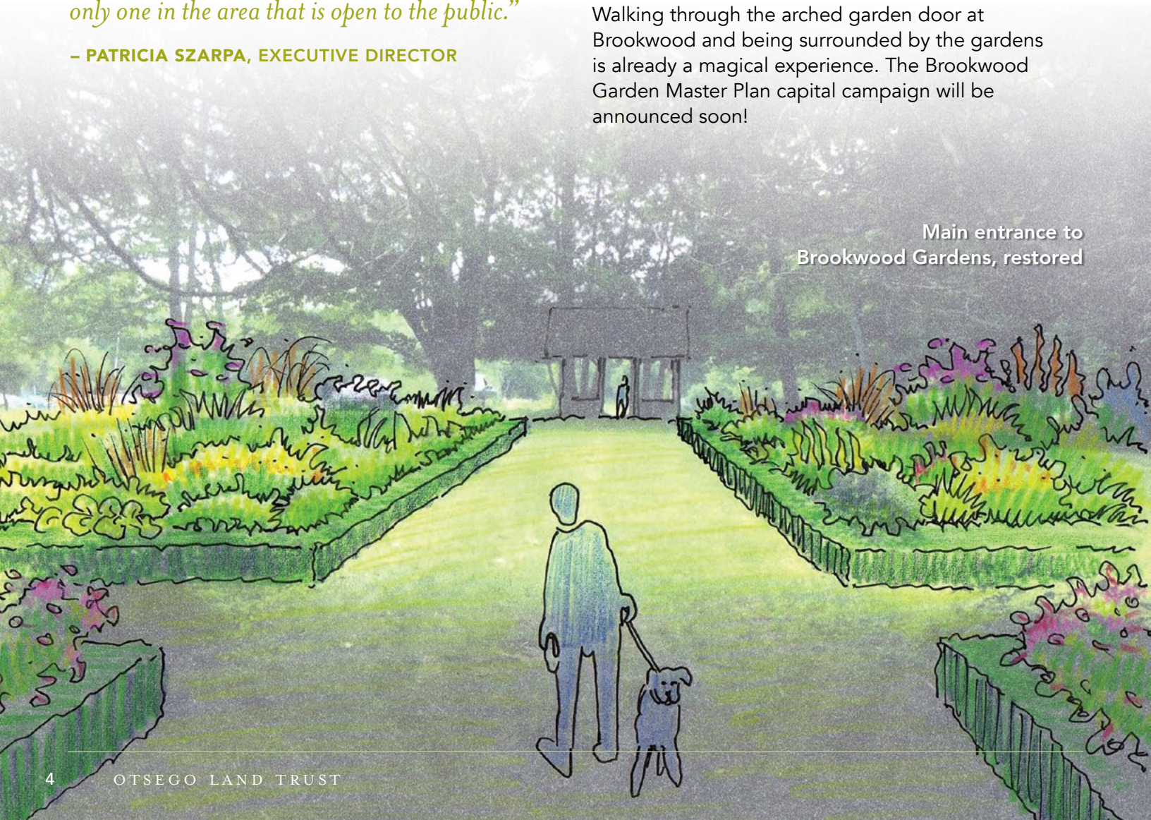
Main entrance to Brookwood Gardens, restored

Walking through the arched garden door at Brookwood and being surrounded by the gardens is already a magical experience. The Brookwood Garden Master Plan capital campaign will be announced soon!